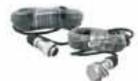
Caravan & Trailer Camera Leads